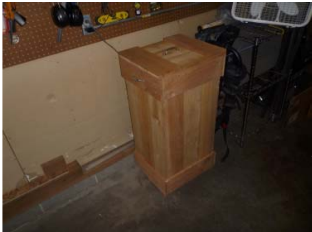
Above: Exterior of smoker